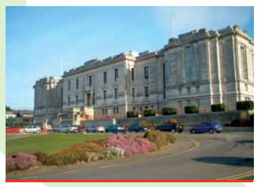
NATIONAL LIBRARY OF WALES ABERYSTWYTH

Undertaking auctions, including two of surplus assets on behalf of the Welsh Government over the last 12 months.