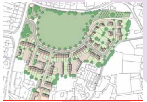
PLANNED DEVELOPMENT OXFORDSHIRE

Managing agents for Talygarn Manor, Pontyclun, comprising 86 properties in a country park.