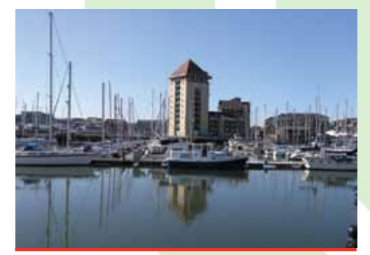
SA1 WATERFRONT SWANSEA

Business Rate advisors to Cardiff University and University of South Wales, Treforest; also advising USW on lease regear at Atlantic House, Cardiff.