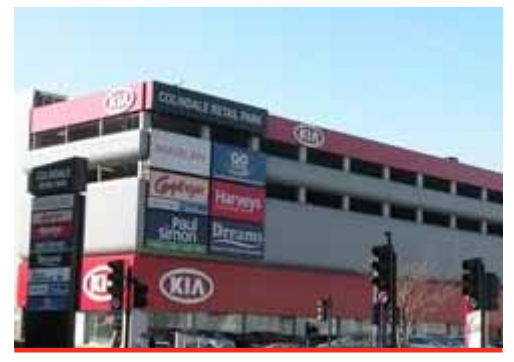
COLINDALE RETAIL PARK