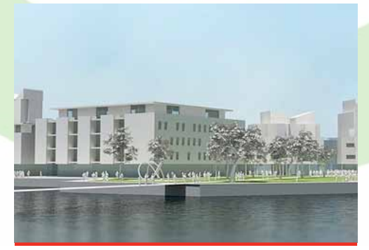
UNIVERSITY OF WALES TRINITY ST DAVIDS