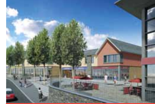
LOWRI PLAZA - BARGOED 'THE PLATEAU'