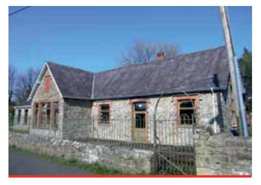
OLD SCHOOL HOUSE CAERWENT

RESIDENTIAL CONSULTANCY - NEWBURY Advising Sandleford Farm Partnership on a scheme for 2,000 new homes near Newbury in Berkshire.